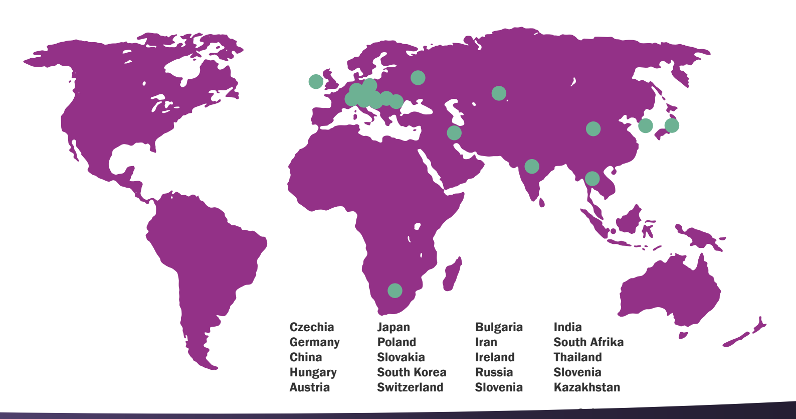
Participants of previous CDEE events based on country origin